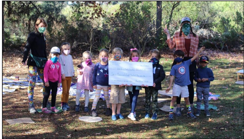
Students from the Native School raised $3,809 for the San Diego County Parks Society by performing acts of kindness.

These acts of kindness were supported with donations from friends and family. Altogether, the students